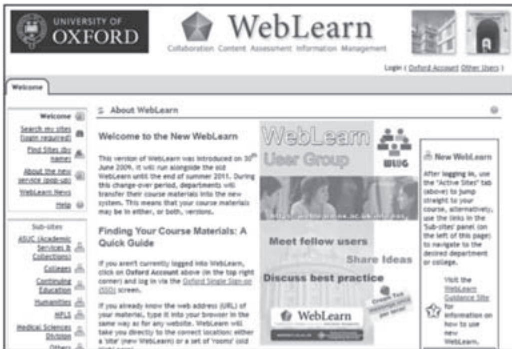
Figure 1: Home Page for WebLearn, Oxford University's Virtual Learning Environment

a kind of portal to resources across the various departments, as illustrated in Figure 1.